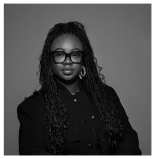
January, 2025, VANCOUVER, BC // Traditional Coast Salish Lands including the x<sup>w</sup>məθk<sup>w</sup>əy'əm (Musqueam), Skwxwú7mesh (Squamish) and səlilwəta<del>l</del> (Tsleil-Waututh) Nations.

This February, the Vancouver Art Gallery is proud to present Celebrating Black Futures , a month-long program focusing on the intersection of art, music, literature and film. The bespoke line-up, brought together in honour of Black History Month and in partnership with Artspeak , Nooroongji Books , Space Lab , the Vancouver International Film Festival , Vancouver Black Library and We the Roses , celebrates Black Futures in Vancouver, Canada and beyond.