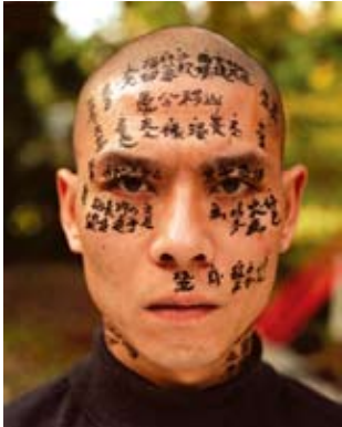
Family Tree, 2000 Color photograph of performance, Amherst, New York Collection of Larry Warsh Zhang_Huan_01