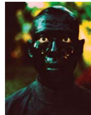
Family Tree, 2000 Color photograph of performance, Amherst, New York Collection of Larry Warsh Zhang_Huan_08