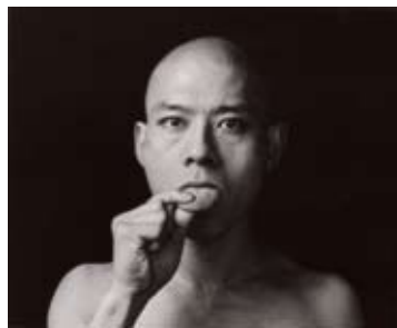
Skin , 1997 Black-and-white photographs Collection of Friedman Benda Zhang_Huan_13