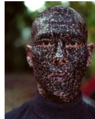
Family Tree, 2000 Color photograph of performance, Amherst, New York Collection of Larry Warsh Zhang_Huan_05