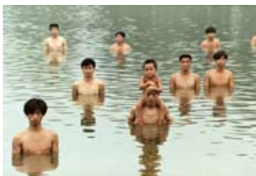
To Raise the Water Level in a Fishpond , 1997 Colour photograph of performance, Beijing, China Collection of the Artist Zhang_Huan_15