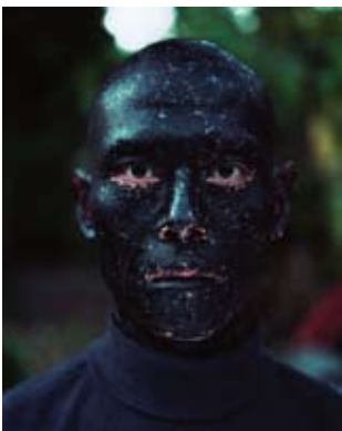
Family Tree, 2000 Color photograph of performance, Amherst, New York Collection of Larry Warsh Zhang_Huan_06