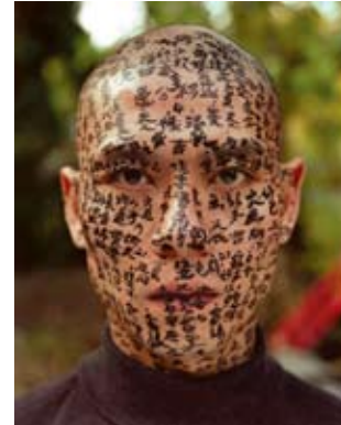
Family Tree, 2000 Color photograph of performance, Amherst, New York Collection of Larry Warsh Zhang_Huan_03