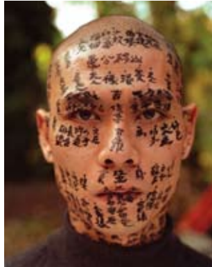
Family Tree, 2000 Color photograph of performance, Amherst, New York Collection of Larry Warsh Zhang_Huan_02