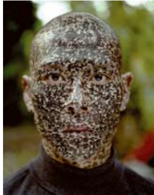
Family Tree, 2000 Color photograph of performance, Amherst, New York Collection of Larry Warsh Zhang_Huan_04