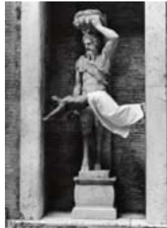
My Rome , 2005 black-and-white photograph of performance, Capitoline Museum, Rome, Italy Collection of the Artist Zhang_Huan_10