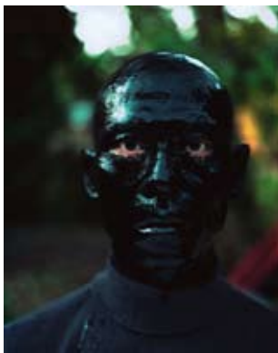
Family Tree, 2000 Color photograph of performance, Amherst, New York Collection of Larry Warsh Zhang_Huan_07