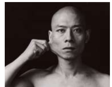
Skin , 1997 Black-and-white photographs Collection of Friedman Benda Zhang_Huan_14