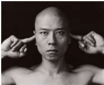
Skin , 1997 Black-and-white photographs Collection of Friedman Benda Zhang_Huan_12