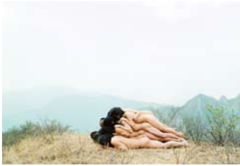
To Add One Meter to an Anonymous Mountain , 1995 color photograph Collection of the Artist Photo: Courtesy of the artist Zhang_Huan_09