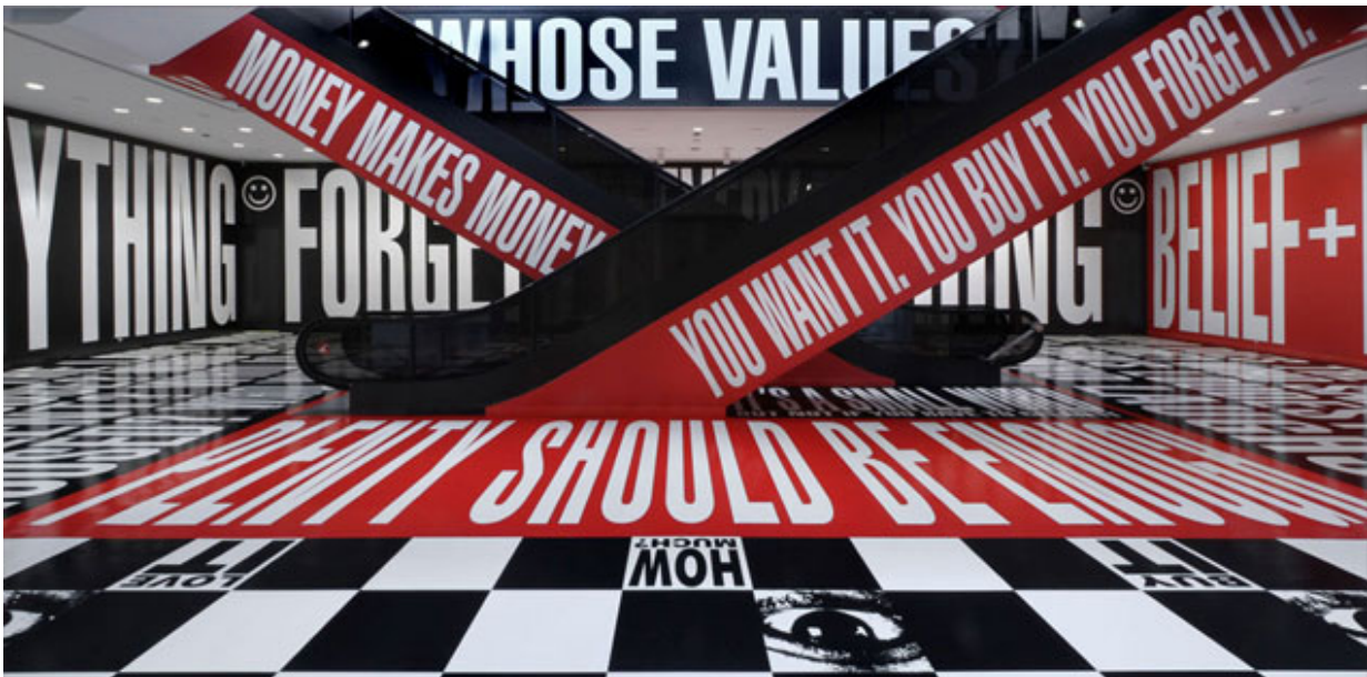
Belief + Doubt, 2012