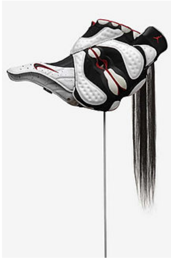
Prototype for New Understanding #8, 1999 Nike athletic footwear, human hair