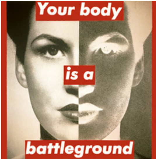
Your Body Is a Battleground, 1989