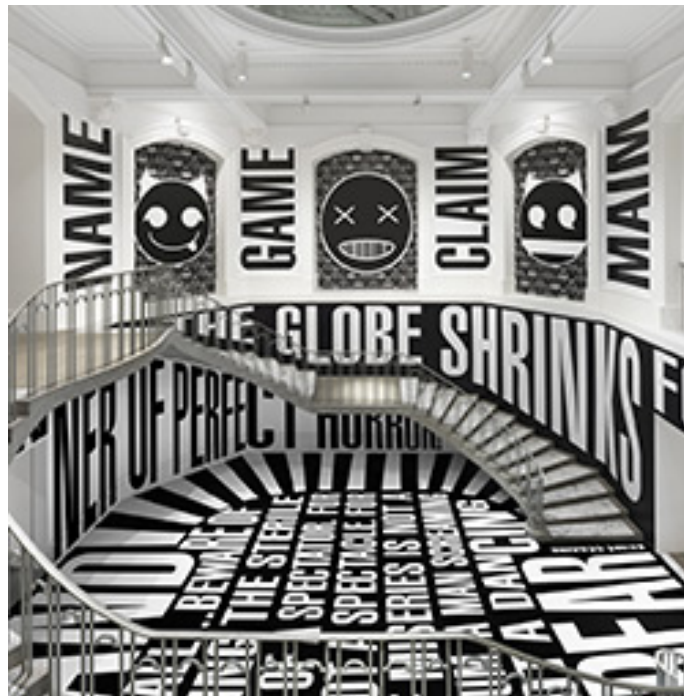
Barbara Kruger, Untitled (SmashUp) , 2016 site-specific installation at the Vancouver Art Gallery

Splicing, Sampling and the Street in the Age of Appropriation