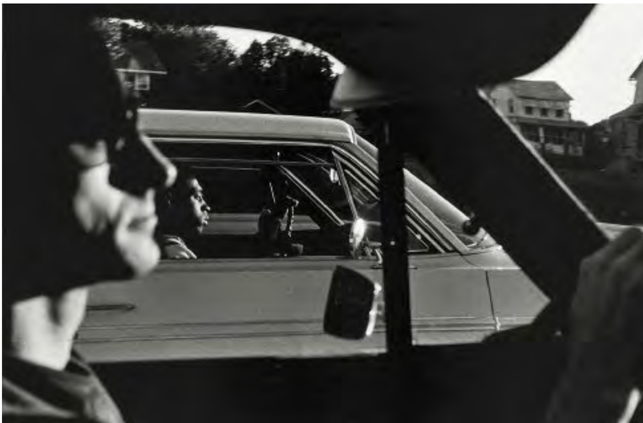
RIGHT: Charles Gagnon, New York State, near Albany , 1966, silver gelatin print, Collection of the Vancouver Art Gallery, Gift of Michiko Yajima Gagnon.

Men's Room, Union Station— Toronto , 1969