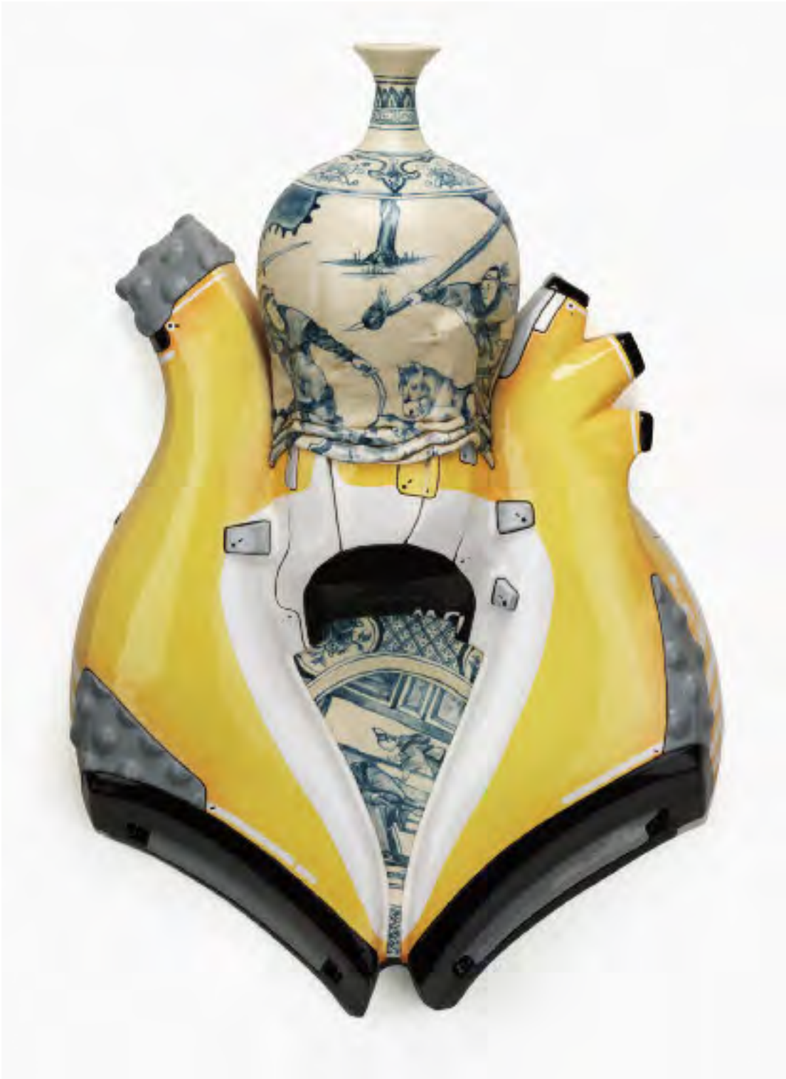
LEFT: Brendan Tang, Manga Ormolu 5.0j , 2010, ceramic, glaze, Collection of the Vancouver Art Gallery, Purchased with the proceeds from the Audain Emerging Artists Acquisition Fund and the support of the Canada Council for the Arts Acquisition Assistance Program.