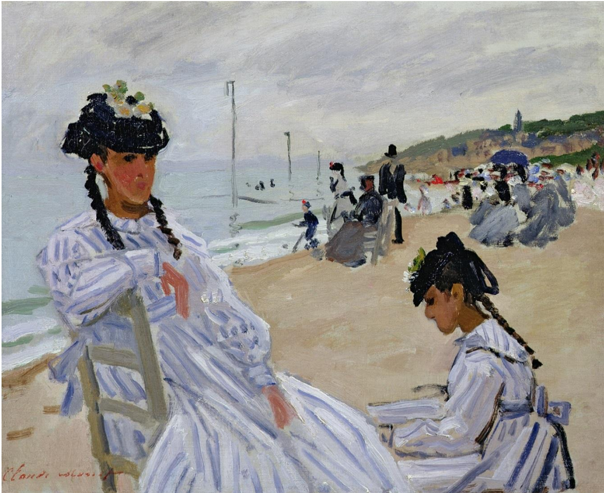
Image Credit: Claude Monet, Sur la plage de Trouville, 1870-71, oil on canvas, Musée Marmottan Monet, Paris